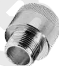
28S-0350 Bushing Adaptor