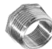
28R-2404 Bushing Adaptor